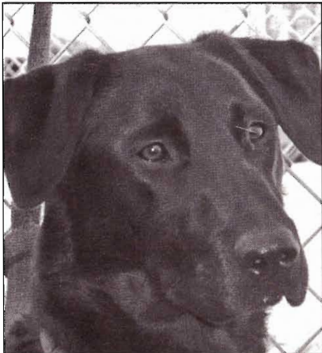
Gia is available at Berea Animal Rescue Berea, Ohio 440-234-2034